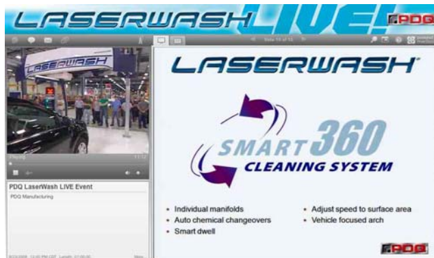
The above image is a screen capture from PDQ's LaserWash LIVE Internet product launch. Viewers could see the new LaserWash inside PDQ's facility where the product will be manufactured.

"Voice of the customer feedback was used in this process to develop the new LaserWash," said Savignac as he addressed the Internet audience. "In that, we worked with you, individual operators across the world, to find out what was most important in terms of features and functions with your car wash, and we heard you loud and clear. You wanted increased car wash speeds, the ability to process more cars on a busy Saturday afternoon, ways to increase revenue per car, reduce operating costs, and we took that into account with this product."